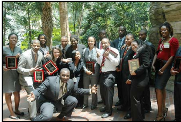
2010 Poster Presenters

Also featured is Nth Dimensions 2011 Orthopaedic Summer Internship Poster Presentations. These young people have outstanding works that are mentored, for the most part, by JRGOS members.